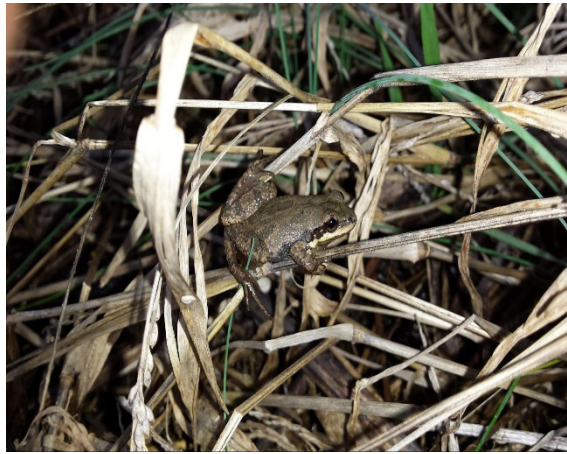
DOR and live Upland Chorus Frogs found at Anglers Park in the city of Danville and WOM WMA respectively.