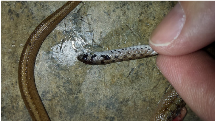
Northern Brownsnake for DOR on Northside Drive in the City of Danville on 24 December 2015.