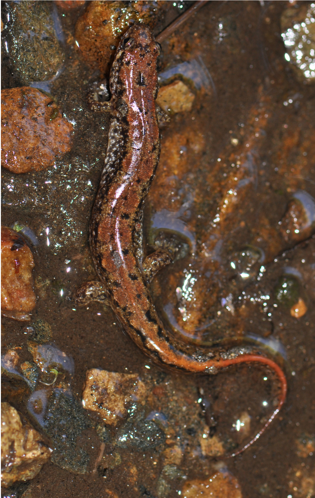
Desmognathus planiceps from Rock Castle Gorge