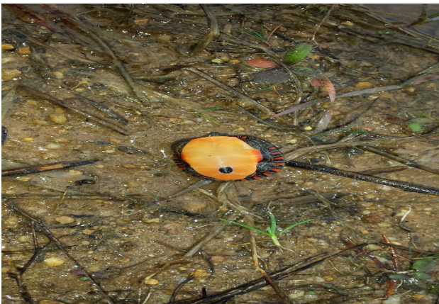
Neonate Eastern Painted Turtle found at WOM WMA on 24 December 2015.

Three Eastern Painted Turtles were observed sitting on logs in the shade at 1421 h in a fishing pond found at White Oak Mountain Wildlife Management Area (36°46'52.05"N, 79°19'23.20"W) on 13 December. One neonate painted turtle (25 mm plastron length, 27 mm carapace length) was found sitting beside a flooded pond at White Oak Mountain Wildlife Management Area (36°46'43.31"N, 79°19'55.78"W) on 24 December. Major flooding of the pond occurred the day before and it is thought that maybe this hatching was disturbed from its nest and came to the surface. On 27 December two adult painted turtles were observed sitting on logs in a fishing pond at 1403 h in WOM area (36°46'52.05"N, 79°19'23.20"W). The air temperature at the time of this observation was 23.8°C and skies were clear and sunny. Both Mitchell (1994) and Ernst and Lovich (2009) have observed basking turtles during all months but neither list any specific dates.