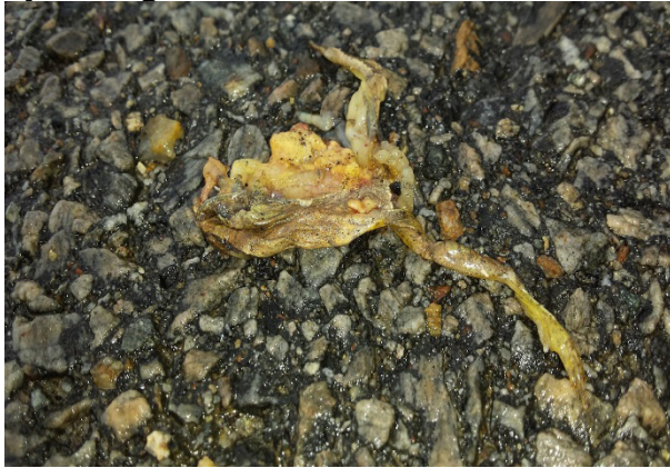
DOR Spring Peeper found on Northside Drive in Danville Virginia on 25 December 2015.

1252 h at a beaver pond in Dan Daniel Memorial Park (36°34'29.89"N, 79°22'0.34"W). This individual was calling from the woods surrounding the beaver pond. On December 25 a small chorus of Peepers was calling from the wetland ditch behind softball diamond #3 at Peaks View Park (37° 25' 22.2"N, 79° 13' 21.7"W). On December 26, three males were observed calling at 1440 h from the forest adjacent to the wetlands at Anglers Park. On 27 December two males were observed calling at 1403 h and 1421 h from the woods surrounding a fishing pond at WOM WMA (36°46'54.98"N, 79°19'24.48"W). The air temperature was 23.8°C. On 27 December, two males were calling at 1443 h from the forest surrounding wetlands at WOM WMA (36°46'47.44"N, 79°19'54.64"W). The last observation for this species occurred on 31 December. A small chorus of 3-4 males was calling with overlapping calls at Peaks View Park in Lynchburg.