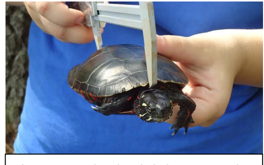
An eastern painted turtle being measured at Chapman Pond.

At the College of William and Mary, students in the Fall 2012 and 2013 Wetland Ecosystems class participated in two days of turtle sampling in